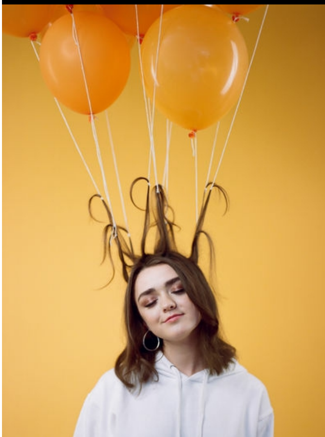
Daisie app by Maisie Williams

08 : 08 : 2018 Culture : Media : Community